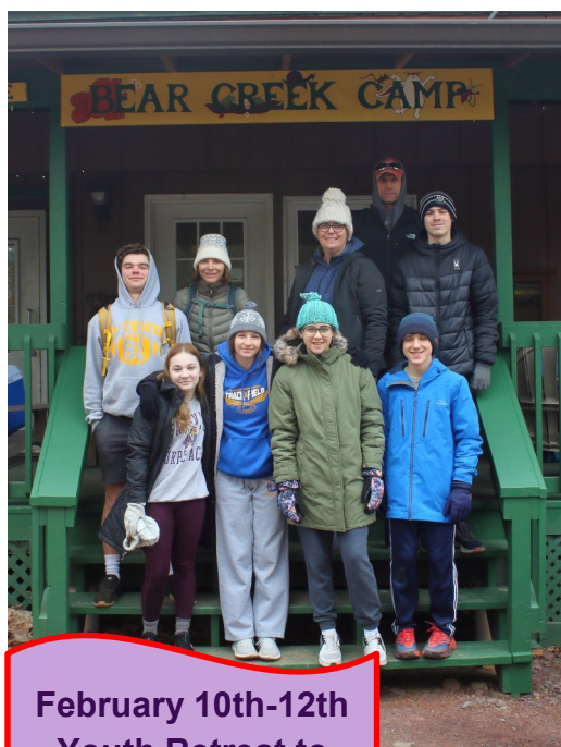
February 10th-12th Youth Retreat to Bear Creek Camp