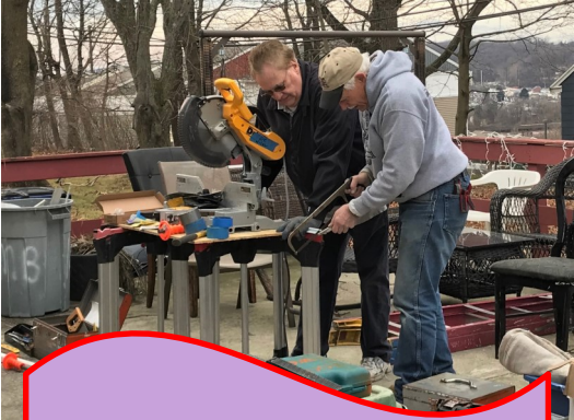
January 28th Good Works Workday