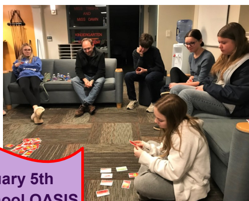
February 5th High School OASIS