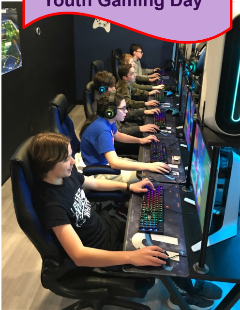
January 29th Youth Gaming Day