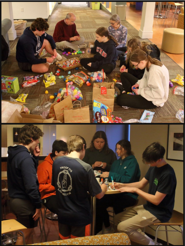
March 15 - OASIS